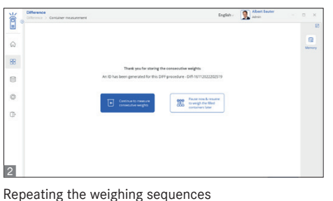
New procedure for difference weighing