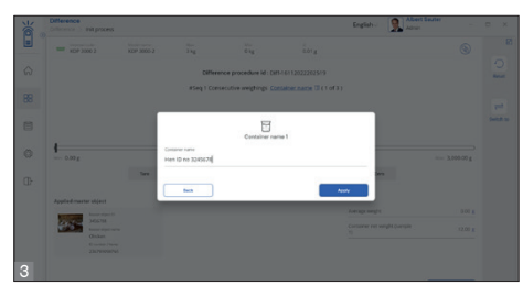
Recalling the sample holder